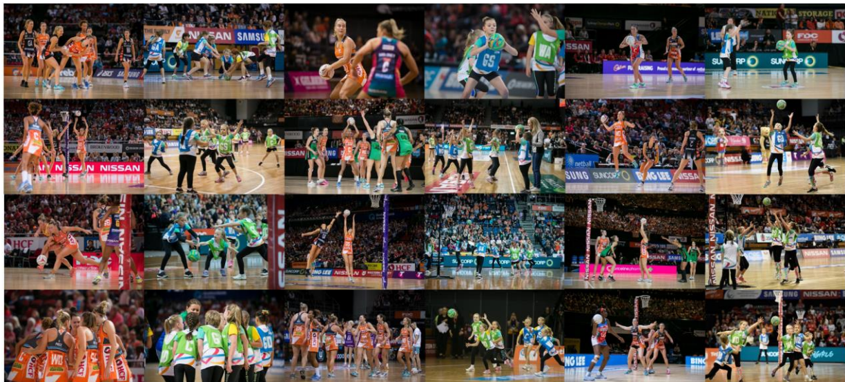
Ball Size, Goal Post Size, Age of Players, Size of Players, Skill Level of Players