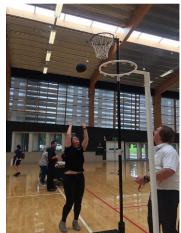
An adult attempting to shoot a 2kg medicine ball into a 12ft goal post.