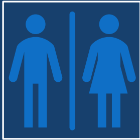
M League (Mens and Mixed)