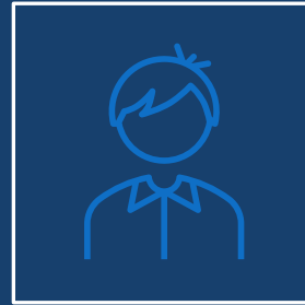
Junior M League