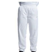
VALOUR ACTIVE - UNISEX TRACK PANT // $80