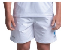
NNSW UNISEX UMPIRE SHORT // $50