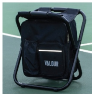
VALOUR COOLER BAG CHAIR // $45