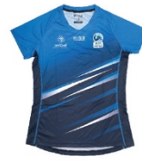
JNR NNSWST PERFORMANCE TEE // $50