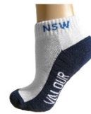
NNSWST SOCKS // $15