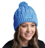
NNSWST CABLE KNIT BEANIE - SKY // $40