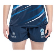
JNR NNSWST SHORTS // $50