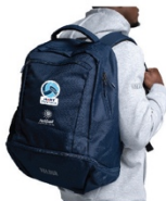
NNSWST BACKPACK // $65