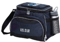
NNSWST COOLER BAG // $45