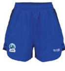
NNSWST TRAINING SHORTS - OCEAN // $50