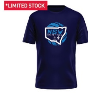
NNSWST STAMP TEE - INK // $40