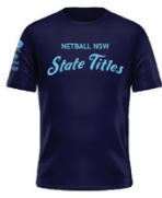
NNSWST PUFF PRINT SS TEE - NAVY // $40