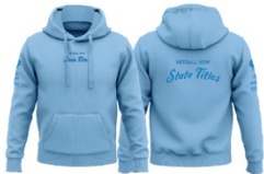
NNSWST PUFF PRINT HOODIE - SKY // $100