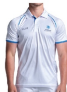
NNSW UNISEX UMPIRE POLO // $70