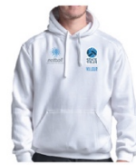
STATE TITLES UMPIRE HOODIE // $80