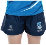
SNR NNSWST SHORTS // $50