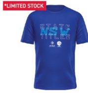
NNSWST TOURNAMENT TEE - OCEAN // $40