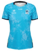
NNSWST TRAINING TEE - LIGHT BLUE // $60