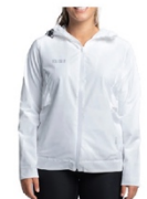
VALOUR ACTIVE - LADIES ELEVATE JACKET // $140