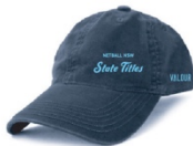
NNSWST WASHED CAP - NAVY // $40