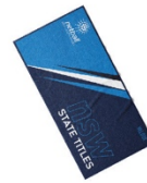
NNSWST TRAINING TOWEL // $40