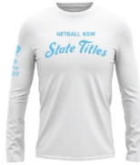
NNSWST PUFF PRINT LS TEE - WHITE // $45