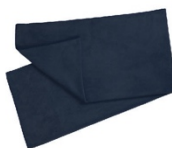
NAVY SPORTS CHAMDIS // $15