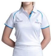
NNSW LADIES UMPIRE POLO // $70