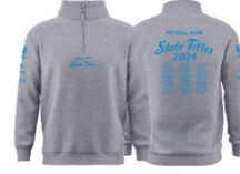
NNSWST HALF ZIP JUNIOR - GREY MARBLE // $100