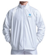
NNSW UNISEX UMPIRE JACKET // $110