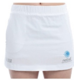
NNSW LADIES UMPIRE SKORT // $60