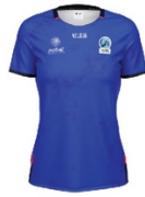
NNSWST TRAINING TEE - OCEAN // $60