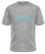
NNSWST PUFF PRINT SS TEE - GREY MARBLE // $40