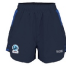
NNSWST TRAINING SHORTS - INK // $50