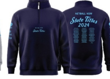
NNSWST HALF ZIP SENIOR - NAVY // $100