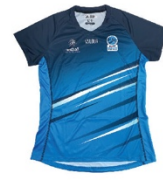
SNR NNSWST PERFORMANCE TEE // $50