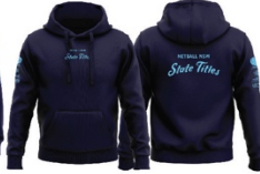
NNSWST PUFF PRINT HOODIE - NAVY // $100