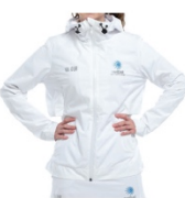
NNSW LADIES UMPIRE JACKET // $110