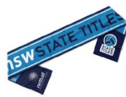
NNSWST POCKET SCARF // $45