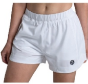
VALOUR ACTIVE - LADIES FLEX SHORT // $55