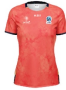
NNSWST TRAINING TEE - CORAL // $60